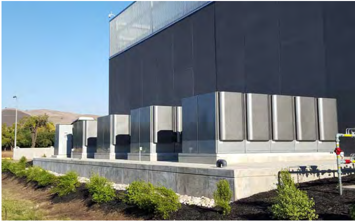
Equinix Data Center