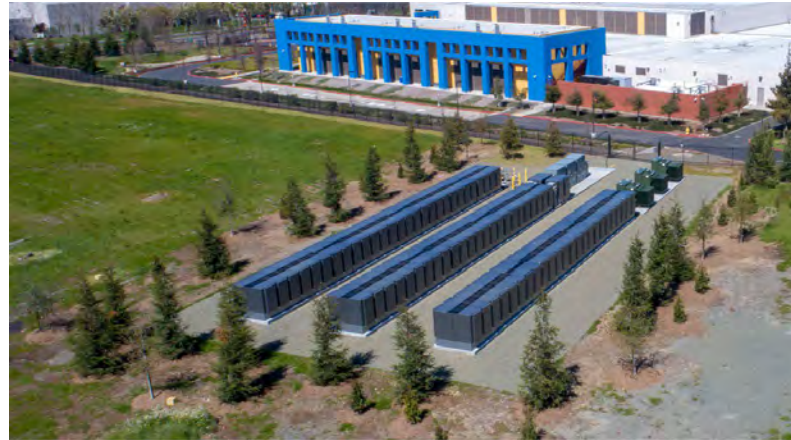
Healthcare Data Center